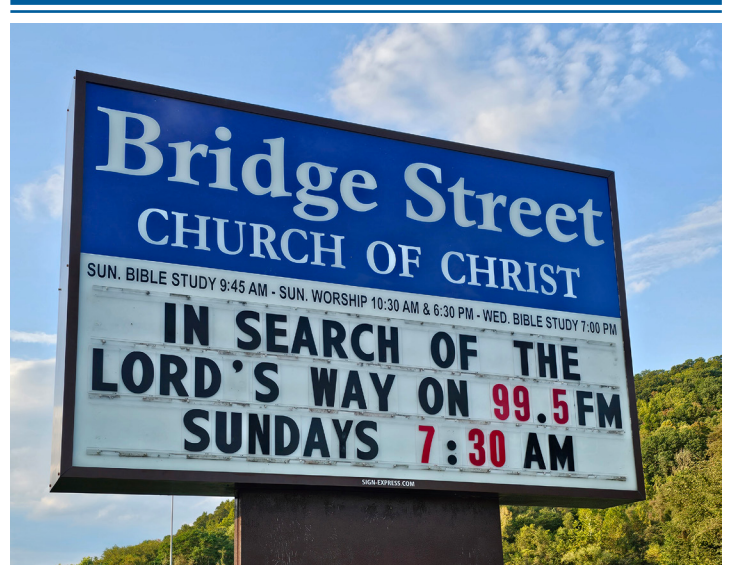
Bridge Street Church of Christ in New Martinsville, WV